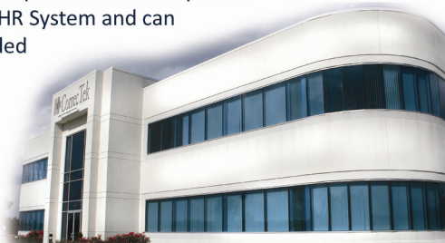
CorrecTek Headquarters Paducah, KY

Our flagship product, CorrecTek EHR, provides a full correctional electronic medical records system equipped with orders, MAR, TAR, reporting, medical alerts and more. Due to the increased demand for an electronic MAR in corrections, we developed the stand alone eMAR in 2010. The eMAR system provides a direct path to the CorrecTek EHR System and can be easily upgraded at any time.